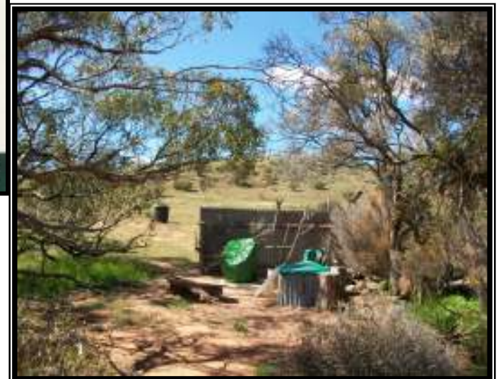
Willangi "Bush Bath" (near campsite), Peterborough.