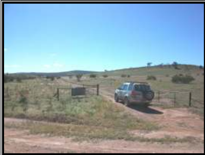
Entrance to Willangi Property, Peterborough.