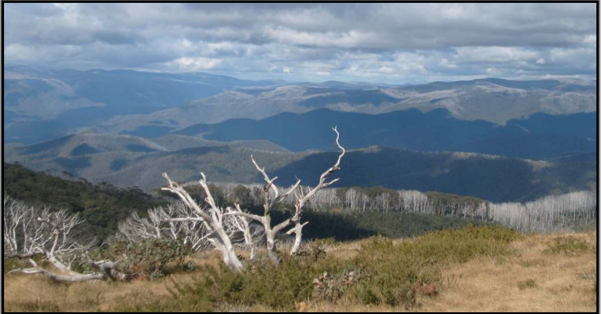
Mountain View, Victorian High Country Club Trip, April 2009