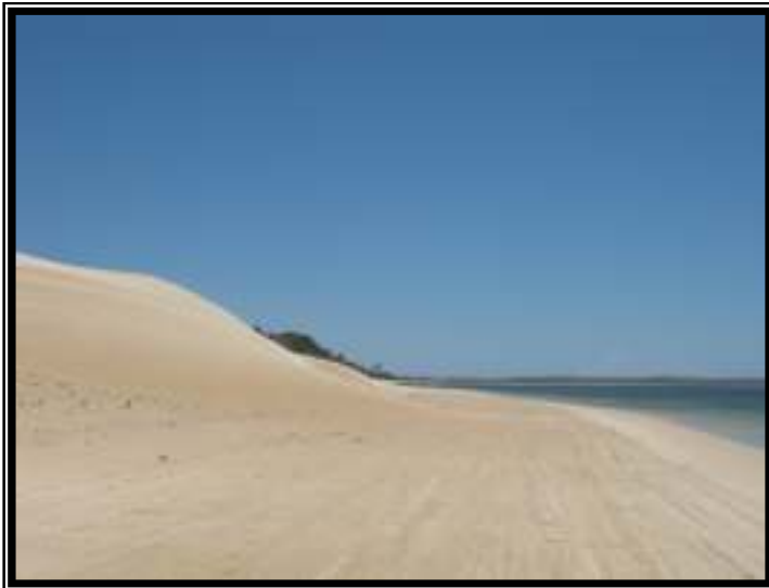
7 Mile Beach, Coffin Bay.