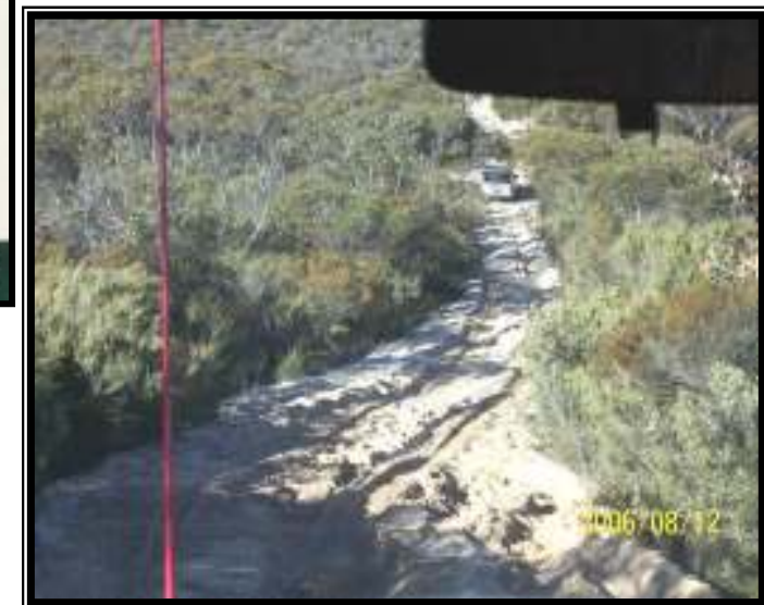
Sand Tracks, "Dorado Downs", Geranium.