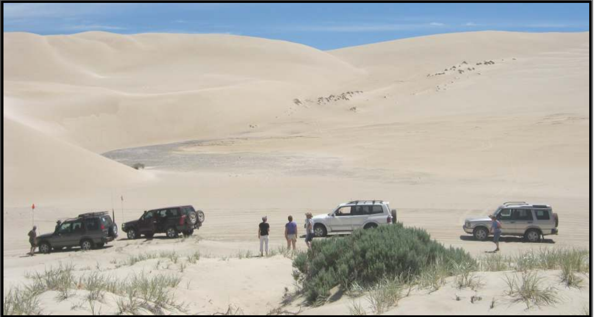
Sleaford Wanna Dunes, Lincoln National Park, Port Lincoln Club Trip, January 2010