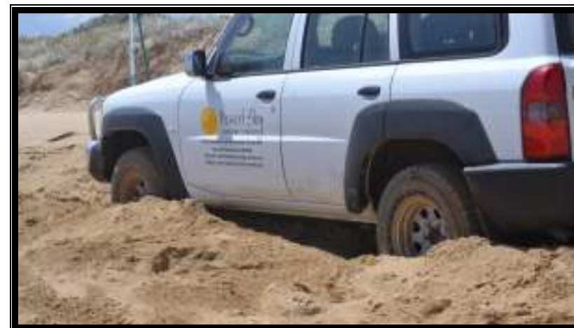
Rudi's Patrol stuck on the beach after assisting in the recovery of another vehicle. (Beachport trip)