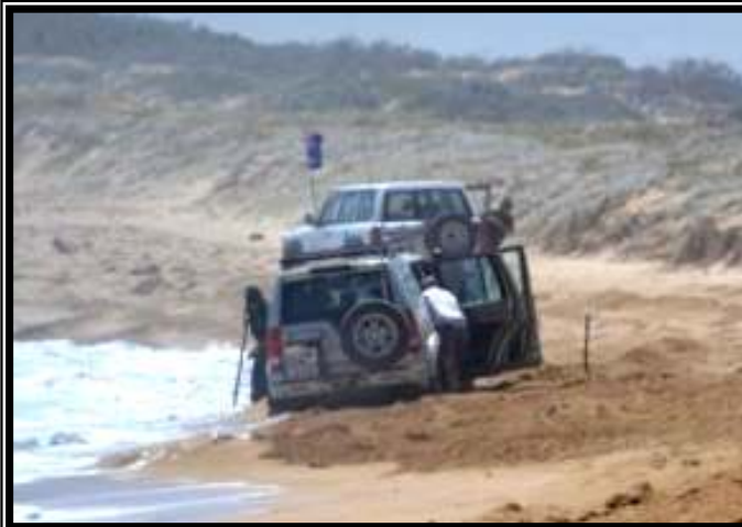
Stuck at the tide line - out with the winch!