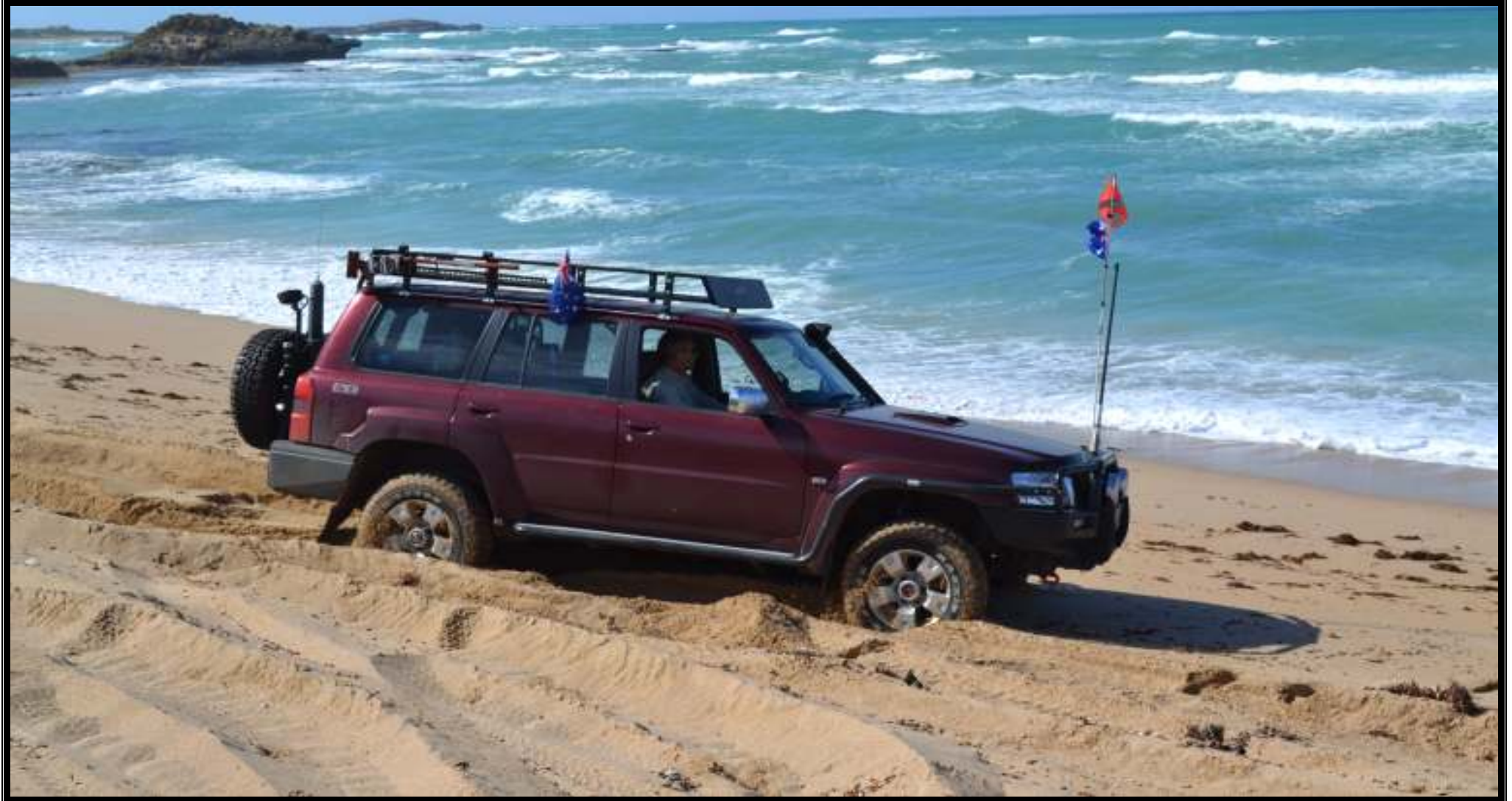
Baz's Patrol, Beachport Club Trip, January 2013